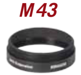
M43 Hyperion® / Morpheus® M43 Extension # 2954250 to adapt lenses with M43-thread – protects the lenses from touching each other