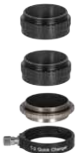
#1508154 15mm extension #2456322 Quick Changer 15mm extension #1508154 15mm extension