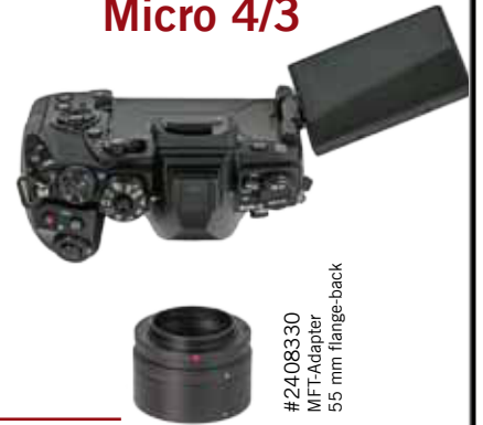
#2408330 MFT-Adapter 55 mm flange-back