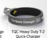
TQC Heavy Duty T-2 Quick-Changer