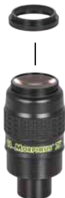
Hyperion® / Morpheus® T-Adapter M43/T-2 # 2958080