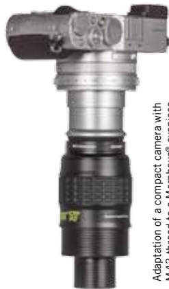
Adaptation of a compact camera with M43-thread to a Morpheus®-eyepiece