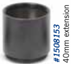
#1508153 40mm extension