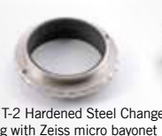
TCR T-2 Hardened Steel Change Ring with Zeiss micro bayonet