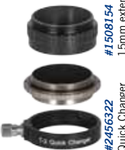
#1508154 15mm extension #2456322 Quick Changer 15mm extension