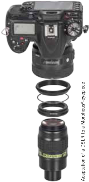
Adaptation of a DSLR to a Morpheus®-eyepiece