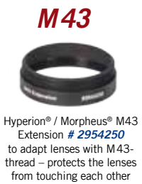
M43 Hyperion® / Morpheus® M43 Extension # 2954250 to adapt lenses with M43-thread – protects the lenses from touching each other

Caution when mounting the camera! Camera-front lenses may be too close to the first lens of the eyepiece only by a tenth of a millimeter. When mounting an eyepiece onto any camera-front-lens, always proceed with the greatest care, possibly using the additional spacer ring. Also make sure that there is not too much weight on the camera lens, to prevent the autofocus-mechanic from damage.