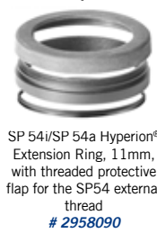
SP 54i/SP 54a Hyperion® Extension Ring, 11mm, with threaded protective flap for the SP54 external thread # 2958090

One adjustment spacer ring made of hard plastic for the SP 54 thread is part of each Hyperion DT-ring free of charge. With these spacer rings (each ring has a thickness of only 1 mm), differences in mechanical heights may be adjusted, to be able to adapt the camera front lens as close as possible, without having to use the 11 mm extension ring (# 2958090).