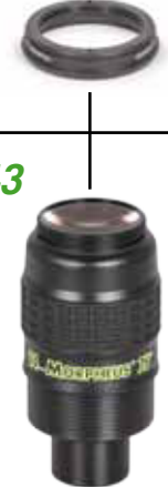
Morpheus® Eyepiece with M43-thread