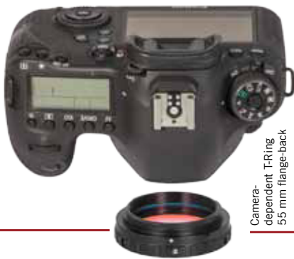
Camera-dependent T-Ring 55 mm flange-back