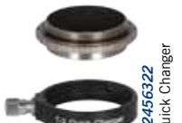
#2456322 Quick Changer