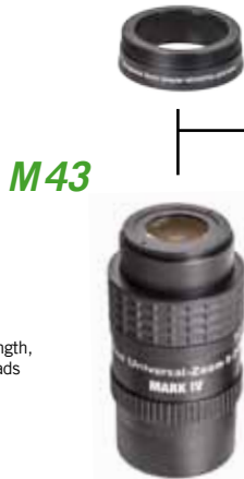
Hyperion® Universal Zoom Mark IV, 8-24mm Eyepiece # 2454826