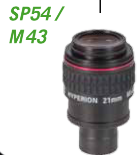
Hyperion® 68° / Hyperion® Aspheric eyepiece with fixed focal length, with M43 and SP54-threads