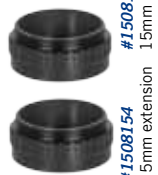
#1508154 15mm extension #1508154 15mm extension