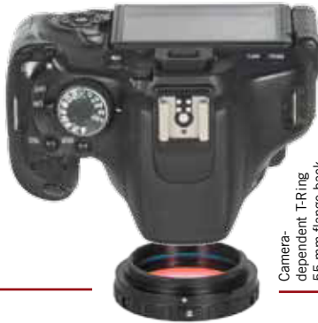
Camera-dependent T-Ring 55 mm flange-back